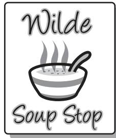
Fig.1: Existing logo for WSS